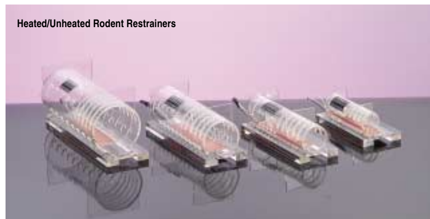
Heated/Unheated Rodent Restrainers