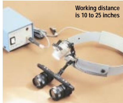
Working distance is 10 to 25 inches

This combination of a 3X or 4X magnifier and halogen light on a comfortable plastic headband is ideal for minor surgical procedures and examinations. The lightweight halogen light provides 1,000 foot-candles of illumination at 45.7 cm (18 in). The headband magnifier