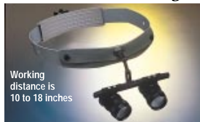
Working distance is 10 to 18 inches

3X or 4X Magnifiers mounted on a comfortable headband. For use with or without personal glasses.