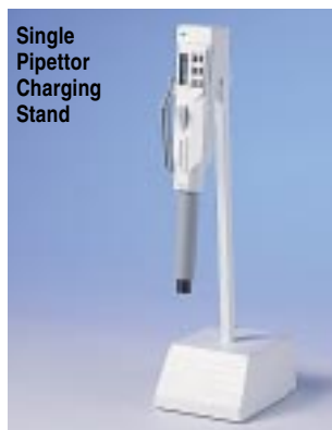
Single Pipettor Charging Stand

* Note: Must specify desired power/plug configuration.