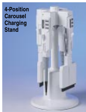
4-Position Carousel Charging Stand