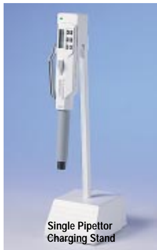
Single Pipettor Charging Stand