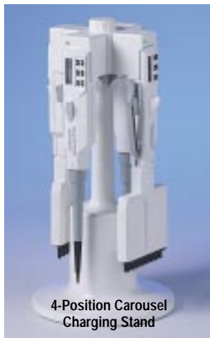
4-Position Carousel Charging Stand