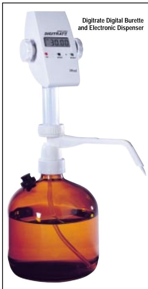
Digitrate Digital Burette and Electronic Dispenser