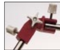
Female to Female Hinged Adapter