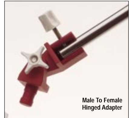
Male To Female Hinged Adapter