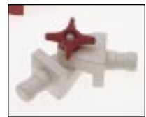
Male to Male Hinged Adapter